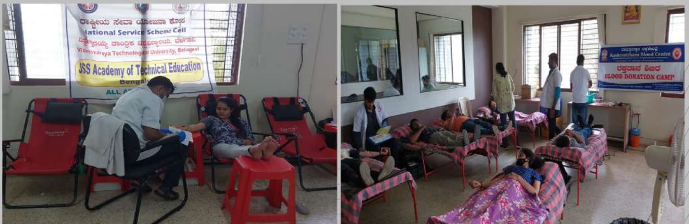
Volunteers donating blood at JSSATE, Bengaluru on 15th June 2022.

The NSS Unit and Information Science and Engineering Department in association with Rotary Bengaluru Gnanakshi Club and Rashtrotthana Blood Bank organized Blood Donation Camp in the Library premises on 15th June 2022 at JSSATE, Bengaluru.