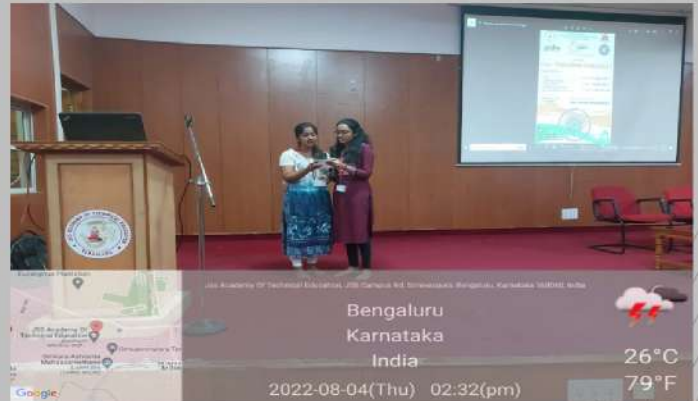
Students are singing patriotic songs on 4th August 2022