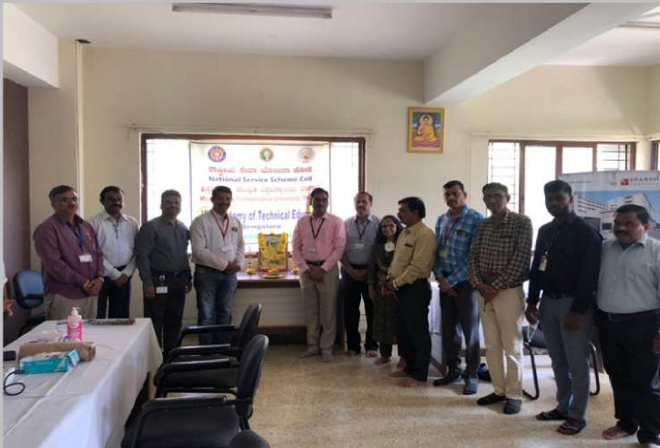
Inauguration of Medical Checkup Camp at Library, JSSATE, Bengaluru on 7 th February 2023.

The NSS Unit of JSSATE, Bengaluru organized a Medical Checkup Camp in association with Sparsh hospital and ICICI Lombard Insurance, Bengaluru on 7 th February 2023 in the Library premises of JSSATE, Bengaluru from 10.00 am to 2.00 pm.