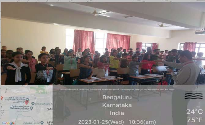
NSS Programme Officer and Students are taking National Voter's Day Pledge