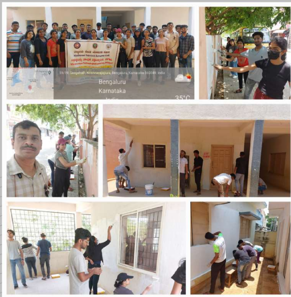
Participation of NSS Volunteers in painting of the primary school, Seegehalli

The NSS unit of JSSATE Bengaluru participated in "School Bell -75" and painted the primary school, Seegehalli near K R Puram, Bengaluru on 27 th April 2022 in association with Campus to the community on the occasion of Azadi Ka Amrit Mahotsav. About 33 NSS volunteers participated in this event. We are proud to be a part of "Rejuvenation of 75 Government Schools" on the occasion of 75 years of Independence and cherish the ideals and morals of our FREEDOM FIGHTERS in their hometowns.