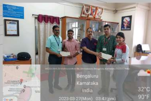
Prize distribution to the winners