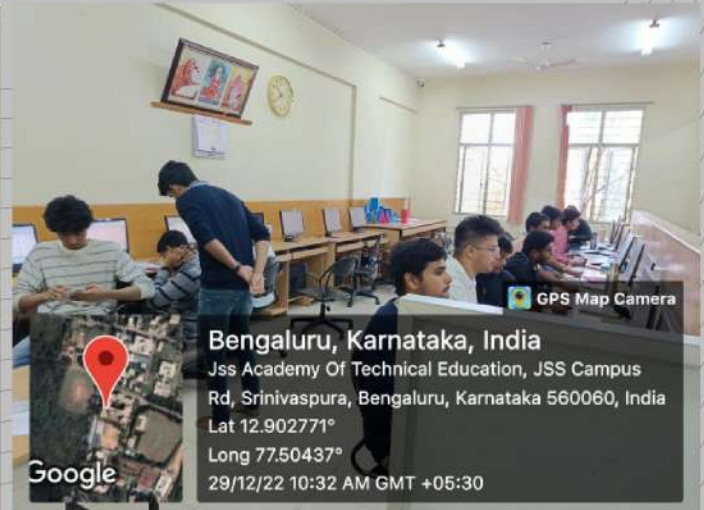
Students Participating in the event