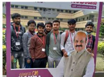
Volunteers of JSSATEB in the YuvaSambhashane Program