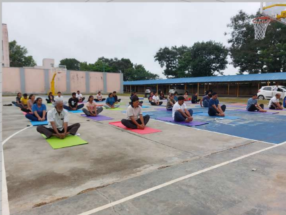
Participants are performing Yoga at JSSATEB Campus.