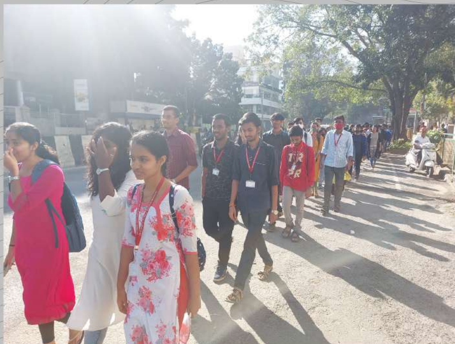
Student Raising Awareness during walkathon