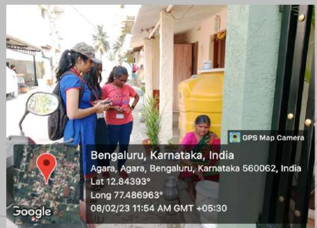
NSS Volunteers conducting survey at Agara Village