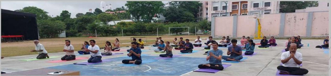
Participants are performing Yoga at JSSATEB Campus.