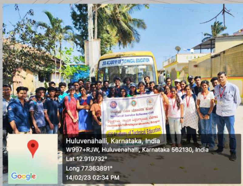
Group photo of NSS volunteers with NSS Programme Officer at Hulavenahalli