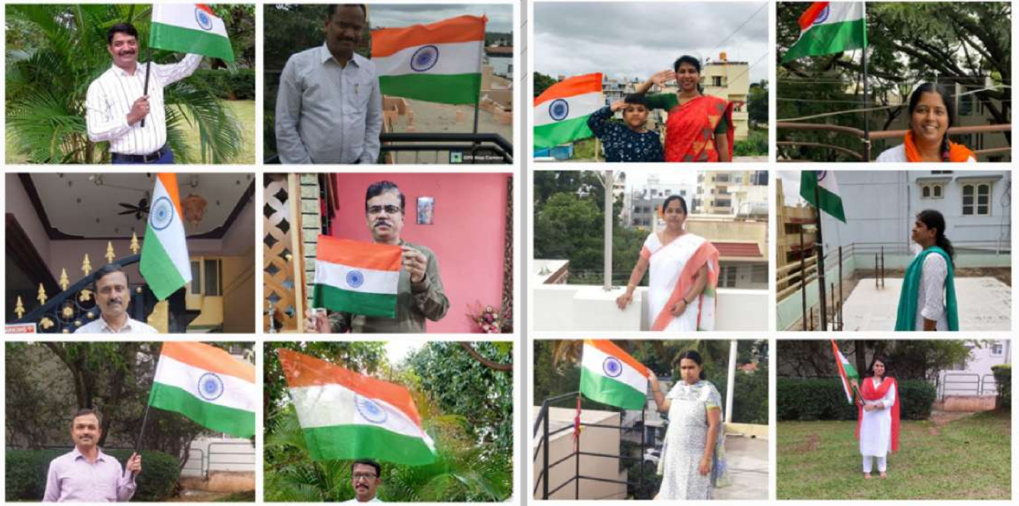
JSSATEB Faculties participating in “Har Ghar Tiranga”