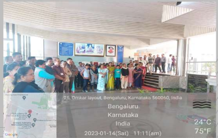
JSSATEB staff and students participation in the celebration of Makara Sankranthi