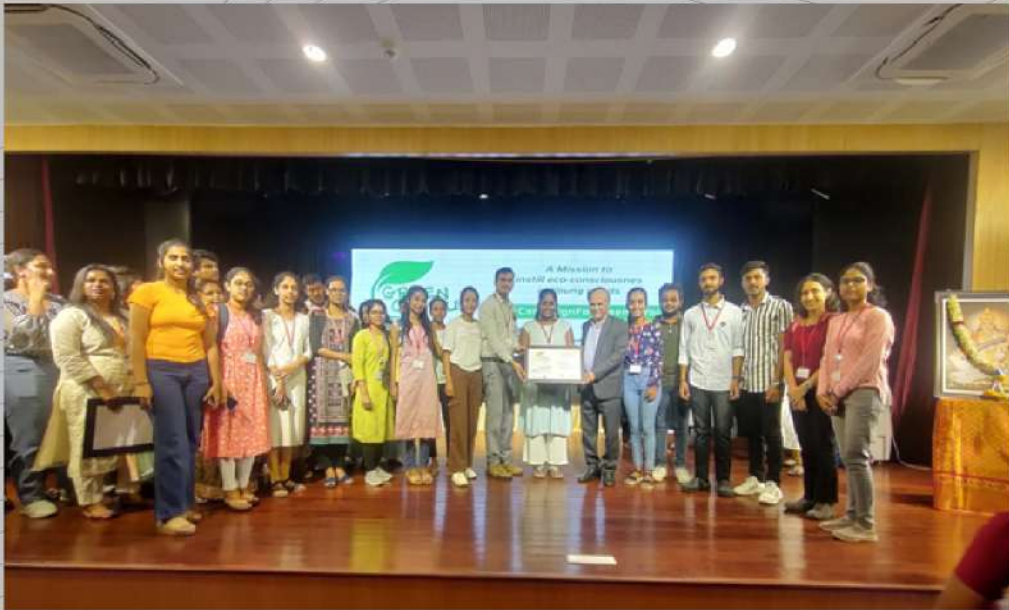
Group Photo with Students