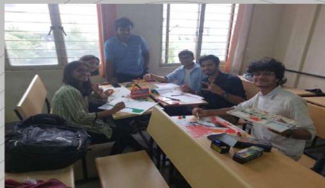
Students are participating in drawing competition