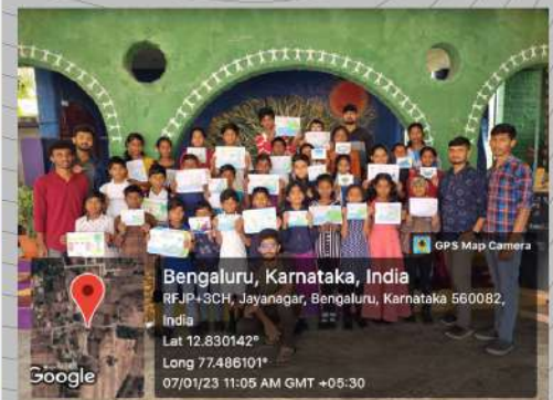
NSS Volunteers at adopted Government Schools with respective Headmasters and Students