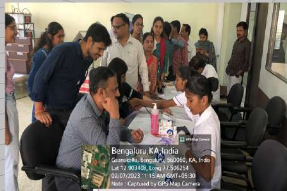
Staff members of JSSATE, Bengaluru are participating in Medical Checkup Camp