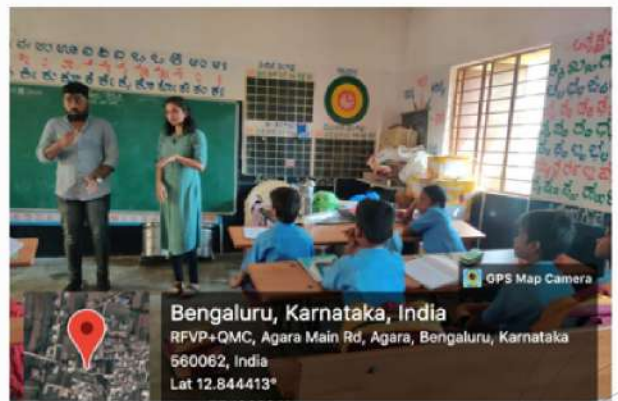
JSSATEB students with Principal and Head master of Higher Primary School, Agara, Kengeri Hobli, Bengaluru.