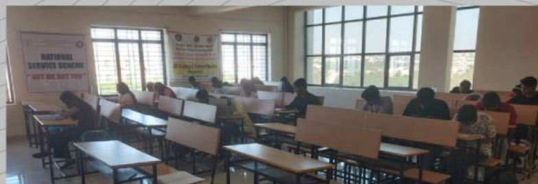
Students are participating in a painting/drawing competition.