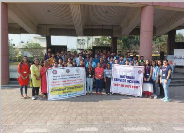
Group photo of NSS volunteers with Principal

The NSS Unit of JSSATE, Bengaluru conducted Village Survey Camp at adopted villages Agara and Hulavenahalli, Bengaluru from 8 th to 14 th February 2023 under Amrutha Samudhaya Abhivrudhi Yojane.