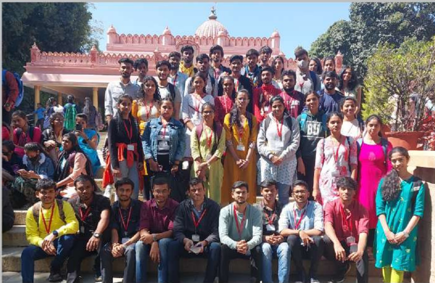
Group Photo on National Youth day

The NSS unit of JSS Academy of Technical Education, Bengaluru participated in the walkathon organized by Ramakrishna Math, Bengaluru on 12th January 2023. About 50 students raised awareness about Swami Vivekananda in this walkathon.