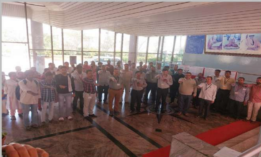
Staff members are taking National Voter's Day Pledge

On the occasion of "National Voters Day," a pledge-taking ceremony was arranged near Swamiji Statue in the academic block A at 11.00 am on the 25th of January 2023. About 60 staff members participated and took the National Voters Day pledge.