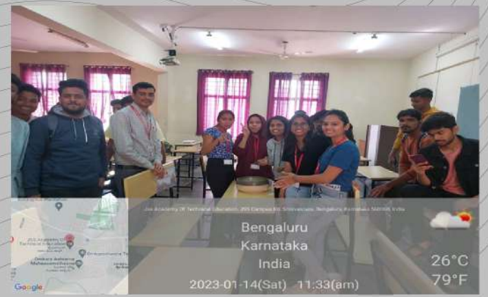
Ellu Bella was distributed to the participants