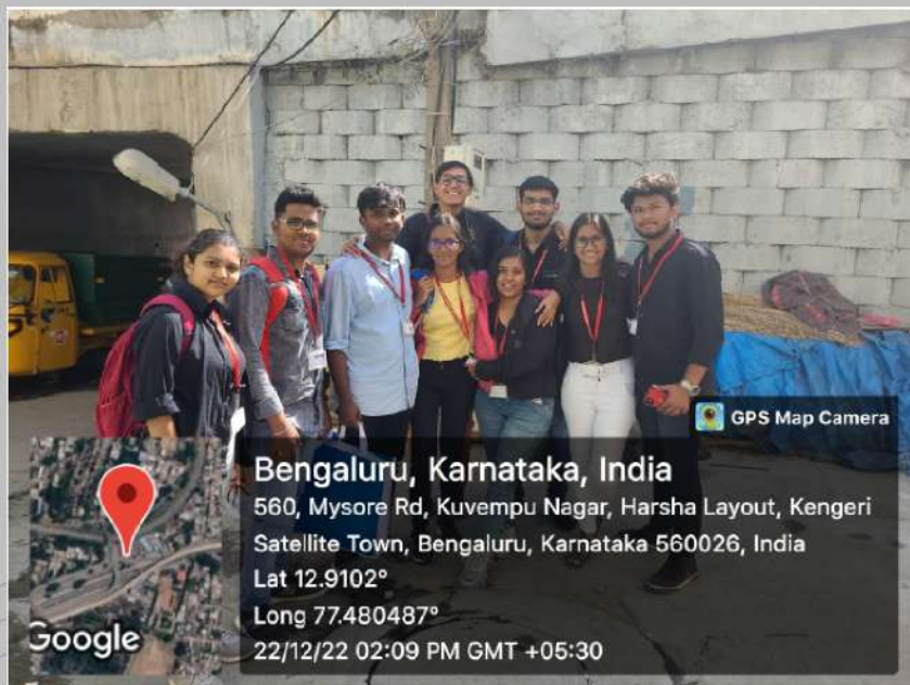
The NSS Volunteers.