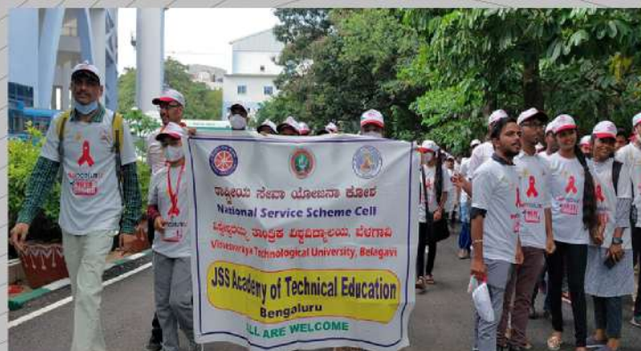
Students participating in Drug awareness Walkathon on 26 th June 2022